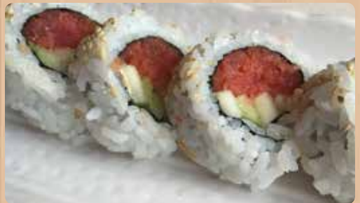
SPICY TUNA ROLL - 8.00 Freshly chopped tuna mixed with spicy sauce and cucumber