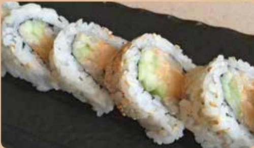
SCALLOP ROLL - 7.50 Freshly chopped scallops mixed with mayonnaise, smelt egg, and cucumber