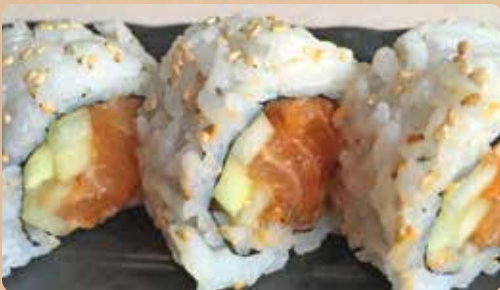
SPICY SALMON ROLL - 8.00 Freshly chopped salmon mixed with spicy sauce and cucumber