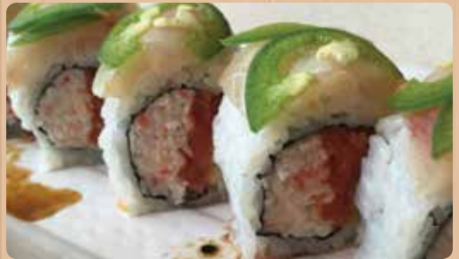
SEXY ROLL - 13.75 Chopped spicy tuna with imitation crab and cucumber, topped with yellowtail and jalapeño