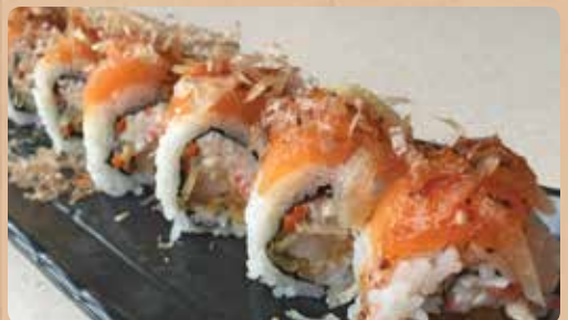
SWEETHEART SALMON ROLL - 13.75 Tempura shrimp, imitation crab, gobo, and lemon, topped with salmon, onion, bonito flakes and spicy tangy sauce