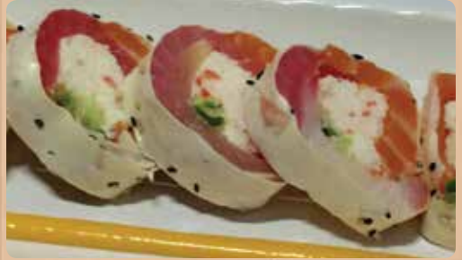
SASHIMI ROLL - 14.50 Fresh tuna, albacore, salmon, red snapper, imitation crab, sprouts with soy wrap—no rice