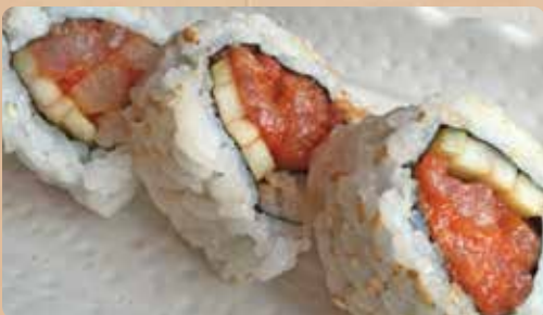
SPICY YELLOWTAIL ROLL - 8.50 Freshly chopped yellowtail mixed with spicy sauce and cucumber