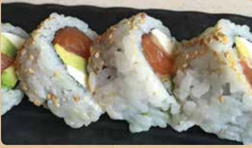
PHILADELPHIA ROLL - 8.00 Fresh salmon, cream cheese, and avocado