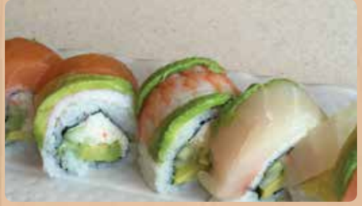
RAINBOW ROLL - 11.00 Fresh salmon, tuna, shrimp, red snapper, albacore, and avocado on top of CA roll