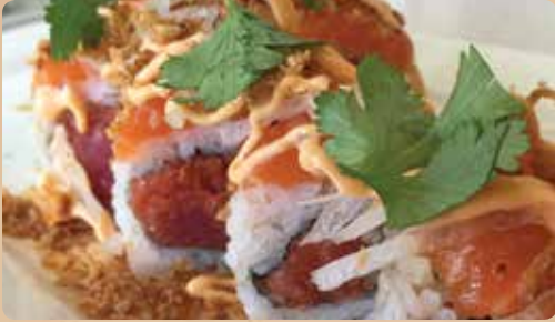
SALMON LOVER ROLL - 13.75 Chopped spicy tuna with cucumber, topped with salmon, onion, and cilantro over special sauce